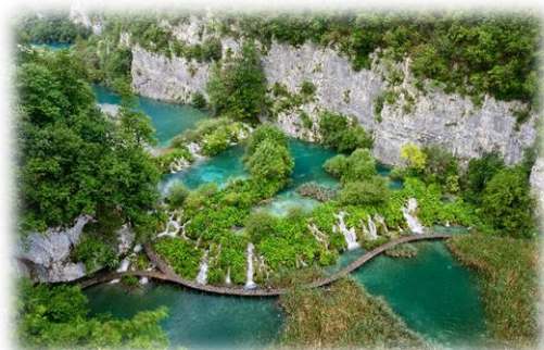
Plitvica Lakes

In addition to its variety and natural beauty, Croatia is also renowned for its unpolluted environment. Today some 8% of Croatian territory is listed as environmentally protected in view of national parks. It is a remarkably valuable and environmentally preserved asset in the very heart of Europe. Of the eight national parks, half are in the mountains (Risnjak, Paklenica, Plitvice Lakes and Sjeverni Velebit), and half are on the coast (Kornati, Mljet, Brijuni and Krka). Of the latter four, all but Krka are on islands.