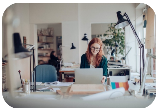
WORKING CONDITIONS AND OPEN SCIENCE