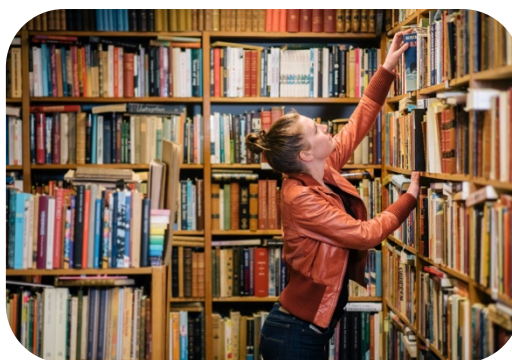
RESEARCH CAREERS AND TALENT DEVELOPMENT