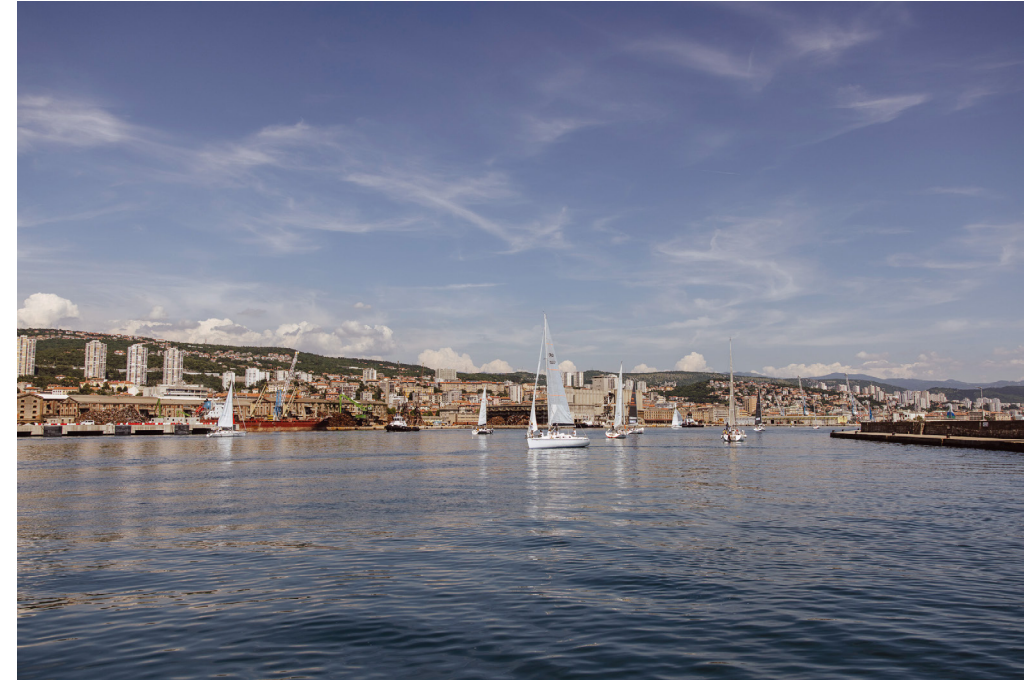
The first YUFE Fiumanka, marking the beginning of this year's 25th jubilee of Fiumanka, took place in Rijeka Bay in June 2024. Teams from all universities within the YUFE Alliance participated, including the YUFE Central Office crew.

The University of Rijeka stands out for its high-quality education, state-of-the-art facilities, and strong ties between academic learning and practical application. As part of the YUFE Alliance, UNIRI provides a truly international experience, fostering collaboration and innovation. With a vibrant campus community and a focus on sustainability, UNIRI is the perfect place to shape your future.