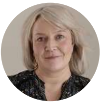
Christina Egelund , Minister of Higher Education and Science of Denmark

Christina Egelund has served as Denmark's Minister for Higher Education and Science since December 2022. A former Member of Parliament for the Liberal Alliance (2015–2019), she also chaired the party's parliamentary group from 2018 to 2019. Her career spans both politics and business, with roles including Special Political Developer at the Confederation of Danish Industry, Public Affairs Director at The Rud Pedersen Group, and Head of Justitia Academy at Think Tank Justitia. Before entering politics, she ran her own business, Jambo Holiday Park, for nearly a decade. Earlier in her career, she worked as a stockbroker in Paris. Christina studied Lettres Modernes at the Sorbonne and holds an upper secondary certificate in mathematics from Hjørring Gymnasium. She has also served on the board of VisitDenmark and as a judge for the Libre Prize. Her background blends political insight with private sector experience and a strong interest in education and public engagement.